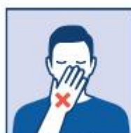
Avoid touching your face.