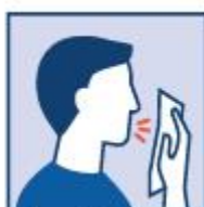
Use a tissue for coughs and sneezes.